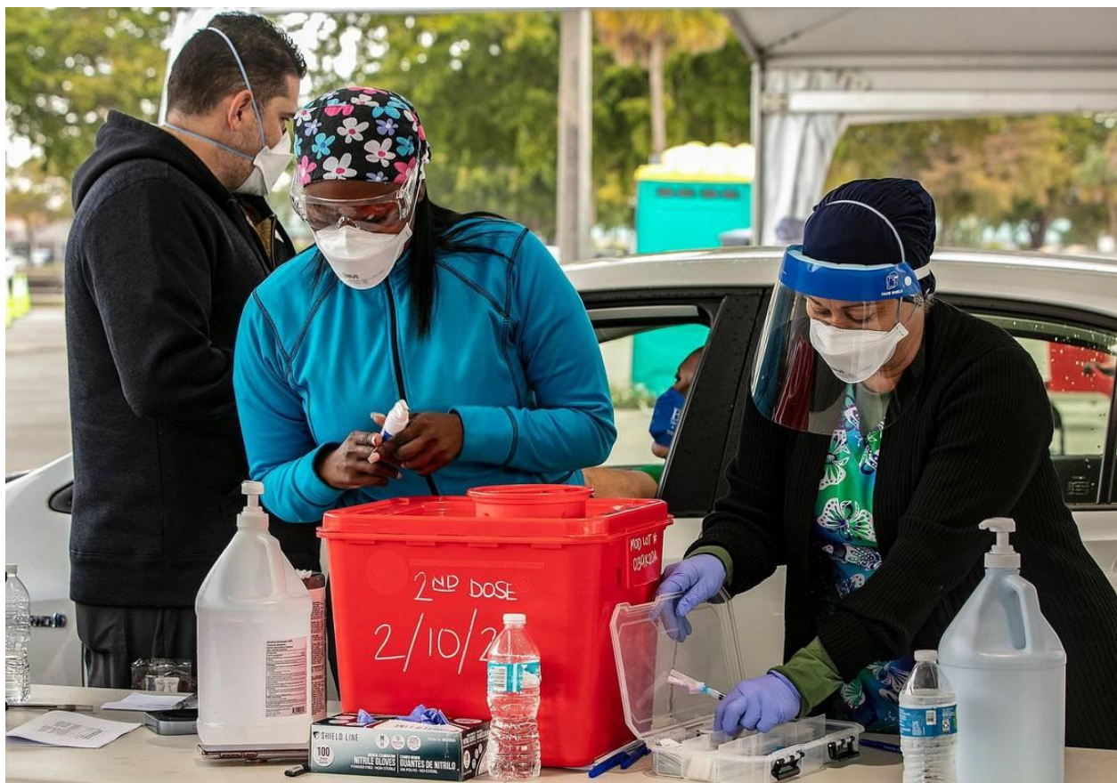
Nurses prepare COVID-19 vaccine shots for Miami-Dade County residents with appointments at Tropical Park in Miami on Wednesday, Jan. 13, 2021.